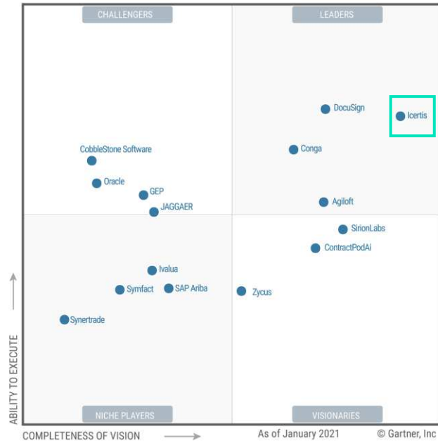
Figure 1: Magic Quadrant for Contract Life Cycle Management